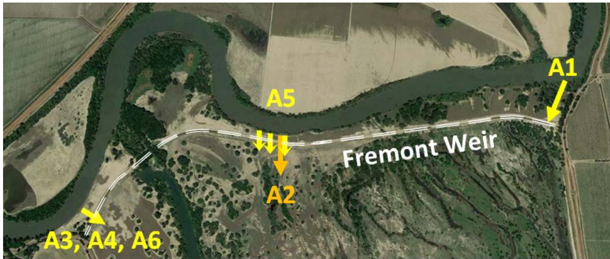
FIGURE 1. Alternative notch locations across the Fremont Weir. Derived from Newcomb and Nelson 2017). See Table 1 for dimensions of Alternative notches.

Several different types of analytical tools have been developed and applied to evaluate the performance of the alternative notch locations and configurations with respect to hydrodynamics, fishes (including their habitat and movement), and agricultural economics. The tools reviewed by this Panel are: